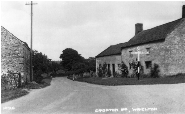
Cropton Lane - from a postcard sent in 1942