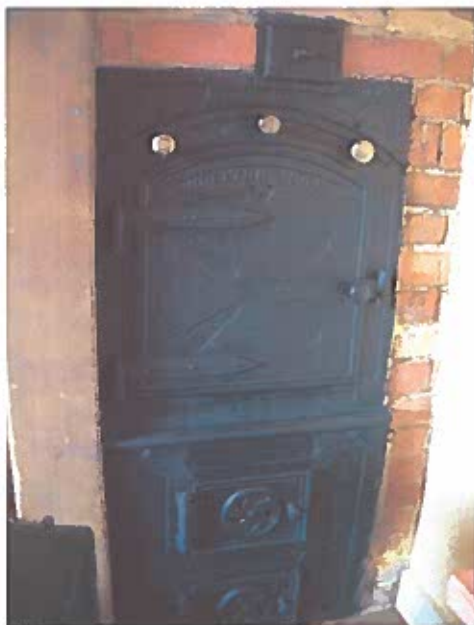
An Original Wrelton Foundry Kitchen Range in Croft Head

WRELTON was inhabited long before recorded history and became, after the Ice Age a settlement on the edge of the Lake of Pickering ( now known as the Vale of Pickering ). During the Roman invasion it stood on the route from Derventia ( Malton ) to Wade 's causeway on Stape Moor. Close inspection of some of the old buildings show what good use was made of this source of free stonework.