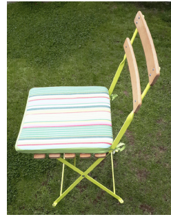
Patio table and 2 chair set in yellow, and another set in aqua. Striped cushions.