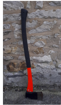
Axe. 90 cms