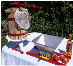
“Selections” Fruit Press and Fruit Crusher. Too many apples & pears? Bottle the juice; cider or perry.