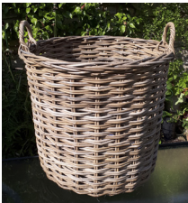
Log basket 50cms tall, 50 cms diameter. Never used.

Also a Parker Multipurpose telescopic ladder with scaffold plates. Suitable for decorating. PMTL-4700-B. Never used.